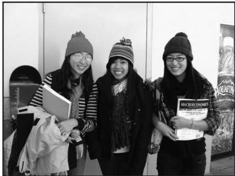
Senior Girls all dressed up!

On Sunday, the class officers, along with helpful volunteers, came to decorate their designated hallways. The