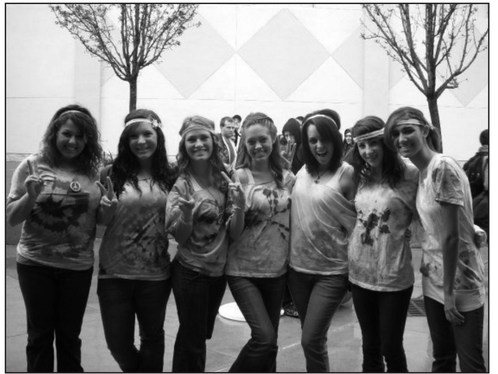
Senior girls sport their retro gear to cap off their final VC Spirit Week.

VC played games on Thursday. Students came decked out in attire that matched their class themes. From the senior class some girls dressed up as Princess Lollipop and Queen Frostine. One group of senior girls got together and spray painted and rhinestoned adorable shirts! Other