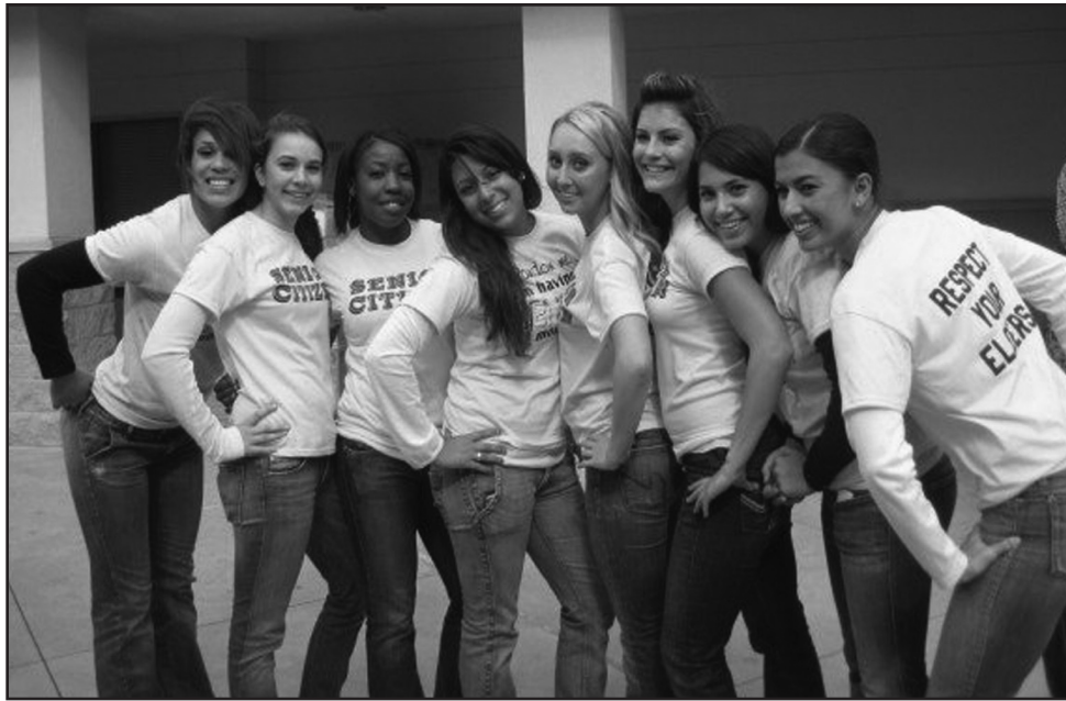
Senior Girls show their Spirit in Matching Shirts

classes. The first round was seniors vs. freshmen and juniors vs. sophomores.