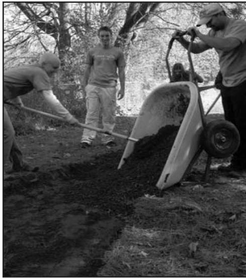
People hard at work, serving their community