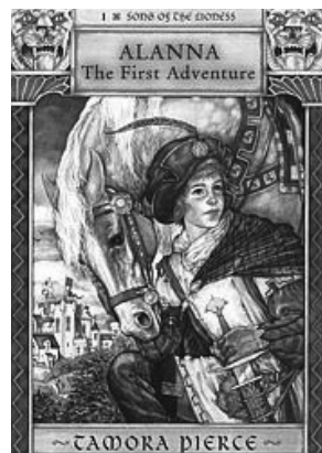
The Book Club's First Novel